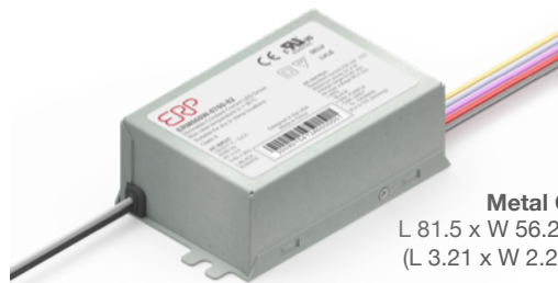
Metal Case L 81.5 x W 56.2 x H 31.5 mm (L 3.21 x W 2.21 x H 1.24 in)